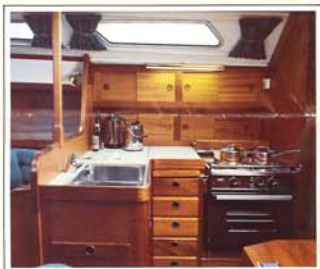
A galley which will satisfy the most demanding chef.

The cockpit, deck and coachroof are teak laid as standard in the Continental version. With regard to equipment, only the best has been considered good enough, from the extra big winches down to the smallest shackle.