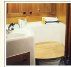
The toilet compartment is roomy with ample showering space.