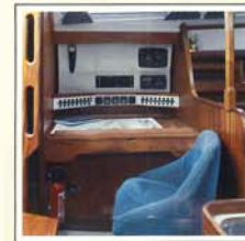
The navigation area is spacious and is equipped with an ingenious fold-down instrument panel.