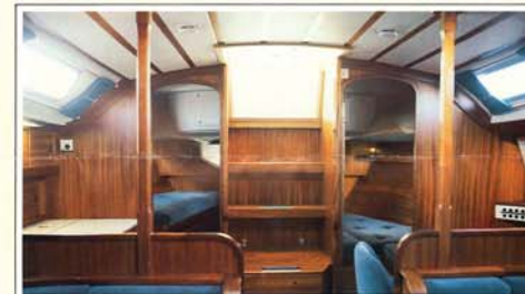
Three comfortable berths in the two separate aft cabins

The feeling of luxury and comfort aboard is absolute, and you can enjoy extended periods of exciting sailing without feeling crowded. A sense of space and privacy has been achieved by separating the saloon, galley and navigation area from the three luxurious and well-proportioned cabins. When you have guests, you will find the saloon large enough to entertain up to ten people around the satin-finished mahogany table; the settees are warm and offer the comfort of any fireside armchair.